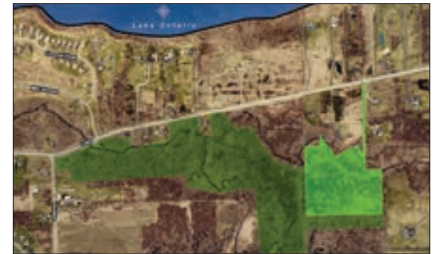
Greenspace: Image of an existing Town property and a newly acquired adjacent property.