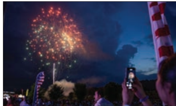
Webster Summer Celebration: event and fireworks display.