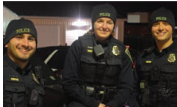
Webster Police: Officers with new full body cameras.

2021 was a busy year for the Town. The beginning of the new year seems an appropriate time to reflect on the changes we made, the growth we experienced, to recognize key personnel changes and to remember one we lost unexpectedly.