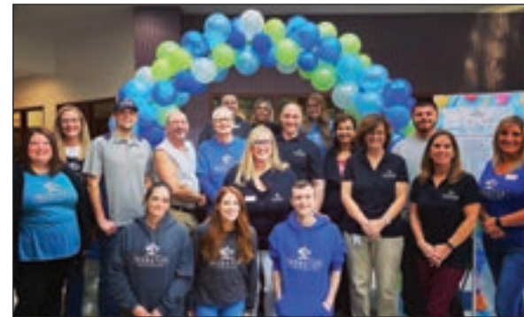
Webster Parks and Recreation: staff celebrate the 10th Birthday of the Recreation facility.