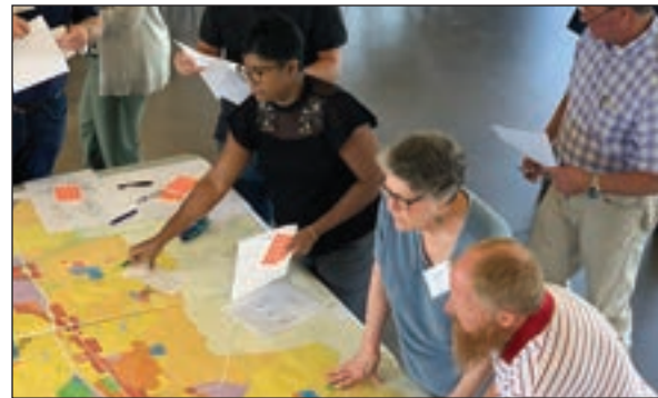
Gathering resident input on Town plans.