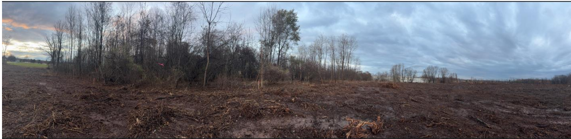
N-NE-E View of site.