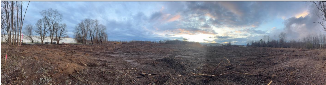
E-SE-S View of site.

Project Name: _ McAlpin Industries Publisher's Parkway (behind U of R Medical Building on Hard Road)