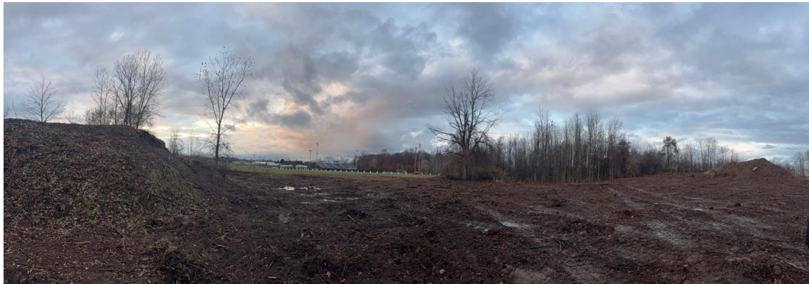
W-NW-N View of site.