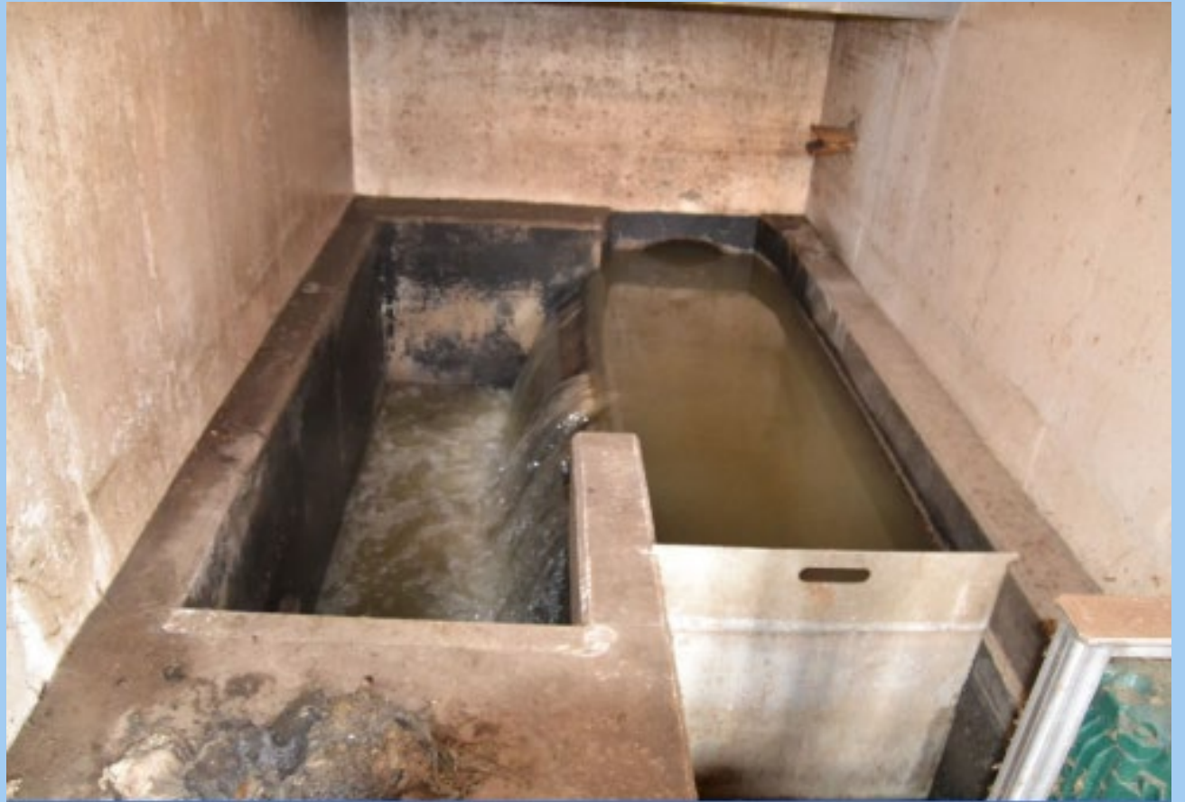
Entrance Structure. Notice incoming flow @ 9:30 am on a weekday.

The Water Quality Improvement Project (WQIP) program is a competitive, statewide reimbursement grant program that funds projects that directly improve water quality or habitat, promote flood risk reduction, restoration, and enhanced flood and climate resiliency, or protect a drinking water source.