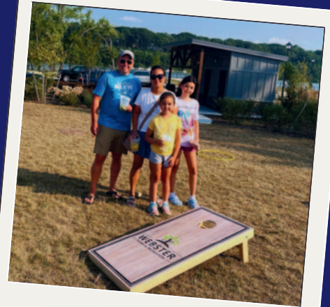
July 2024: Sandbar Park Splendor!