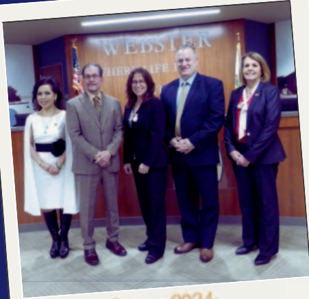
January 2024: Webster Town Board at 2024 Organizational Meeting.