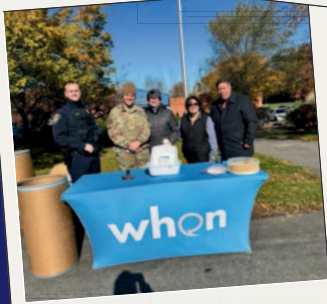
October 2024: Webster Drug Take Back Event