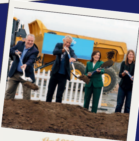
April 2024: Ground is officially broken at fairlife® project site.