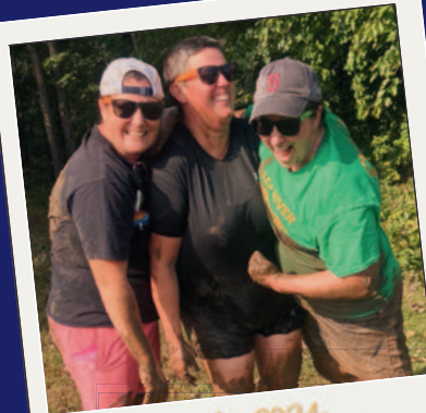
September 2024: Community Mud Run!