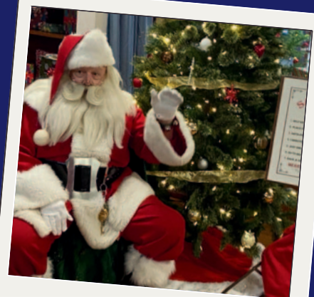
December 2024: Santa visits Webster.