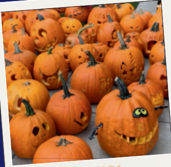
October 2024: Pumpkins on Parade 2024.